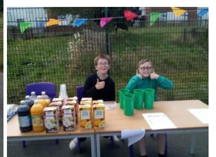
Happy holidays, everyone! We look forward to seeing you all again in the new term!